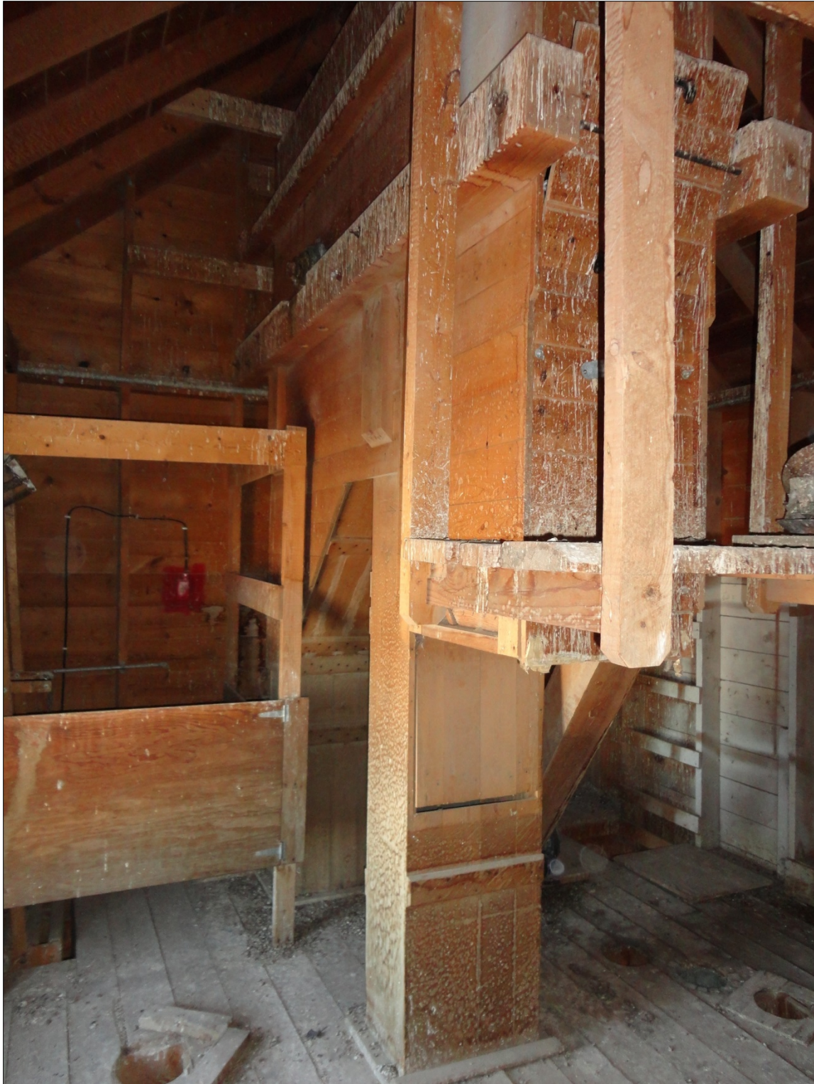
Figure 16: Interior damage from pigeon feces