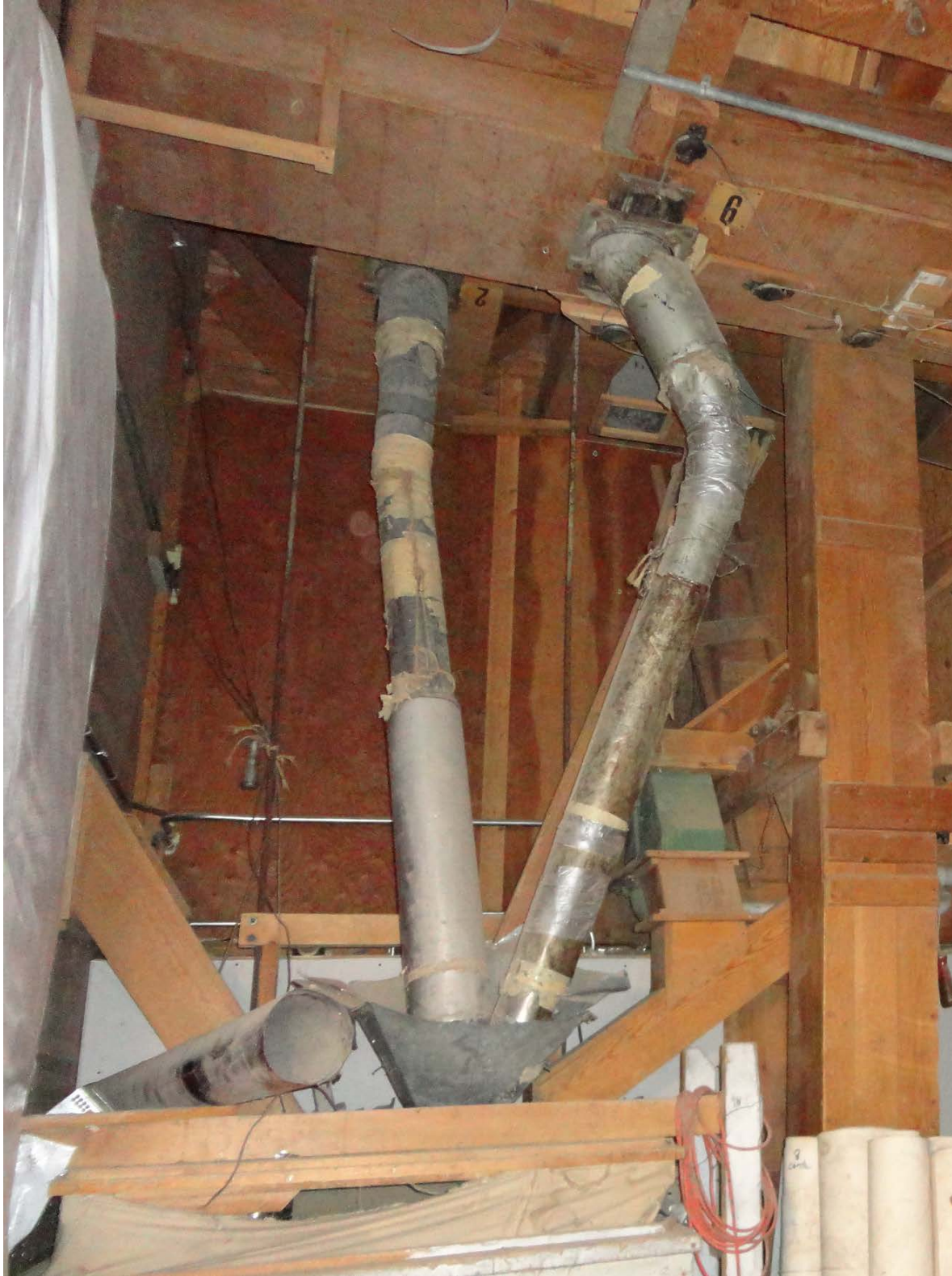
Figure 11: Interior