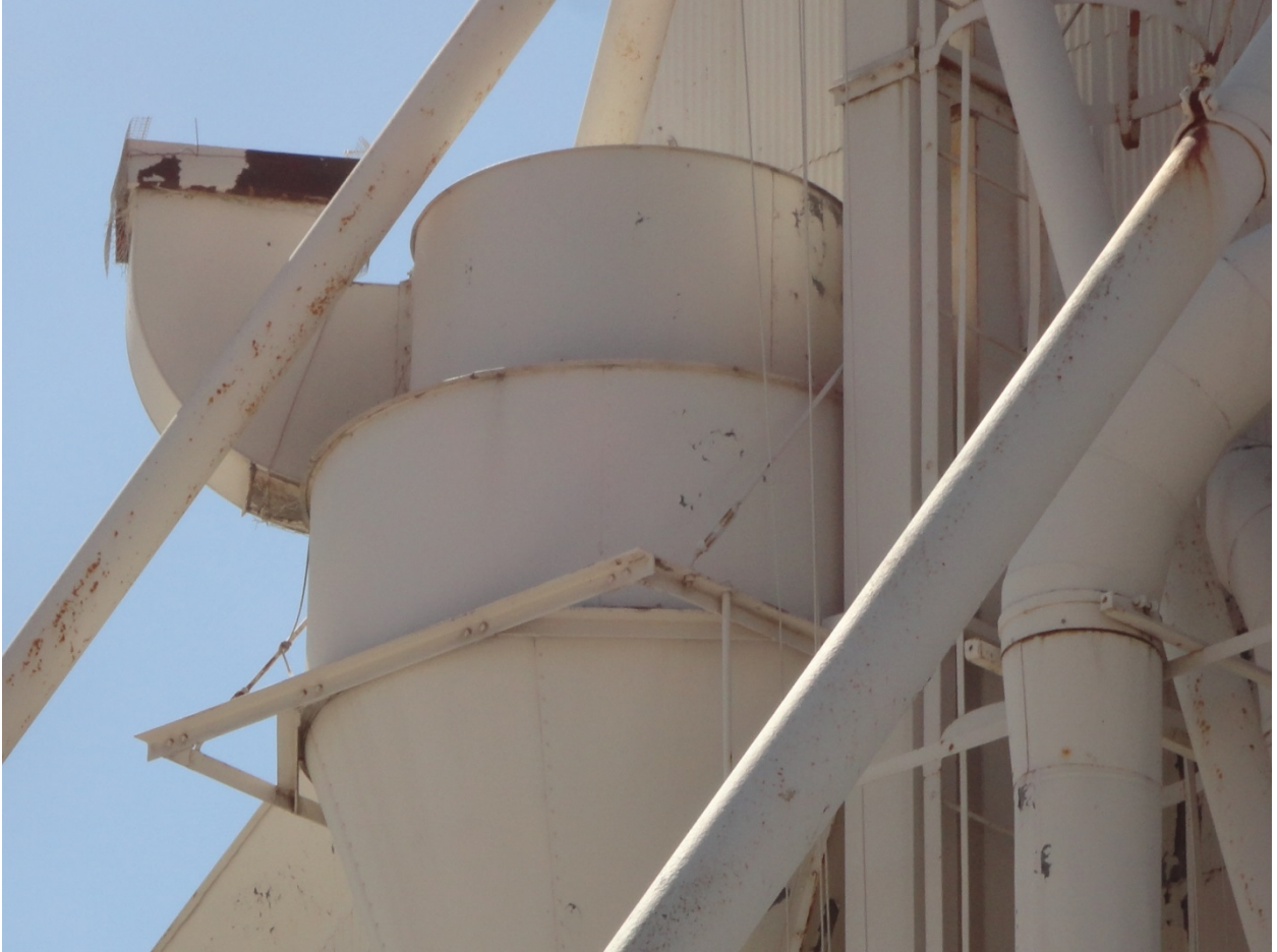
Figure 21: Close-up roof top equipment