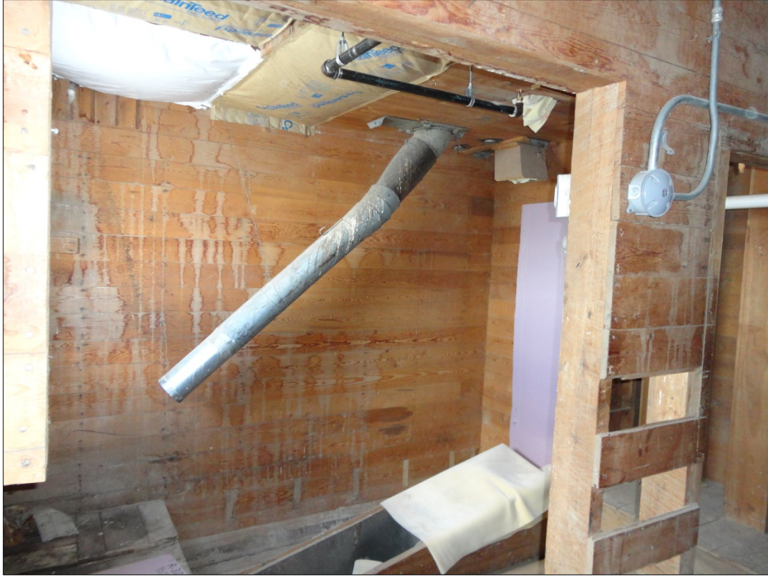
Figure 7: Interior penetration and water damage