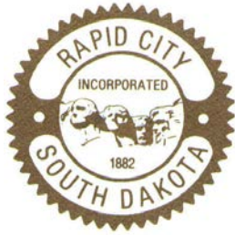
Exhibit 5: Correspondence with Rapid City Fire Department