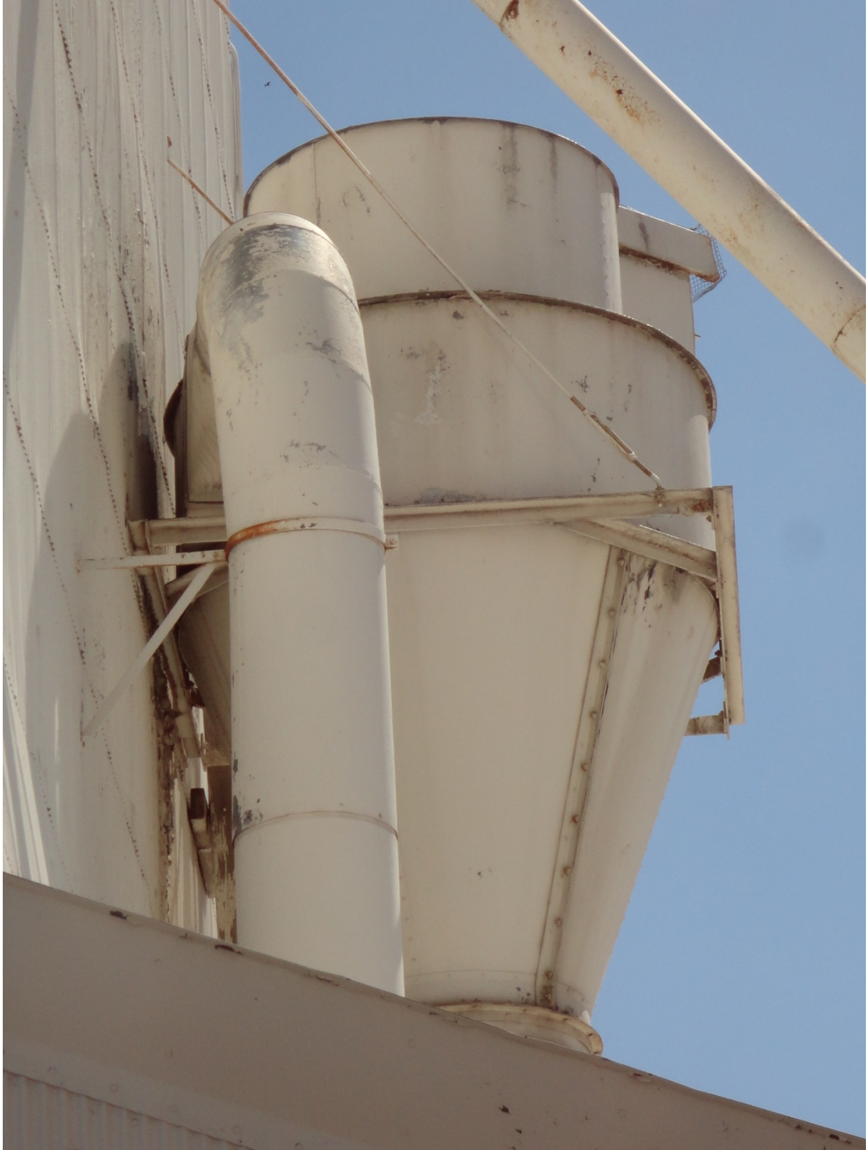
Figure 22: Close-up roof top equipment