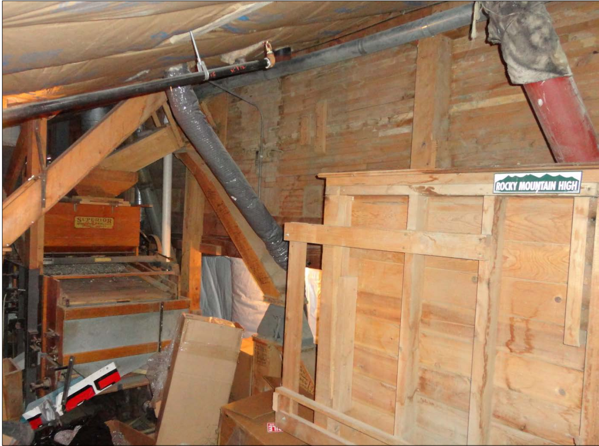
Figure 9: Additional interior