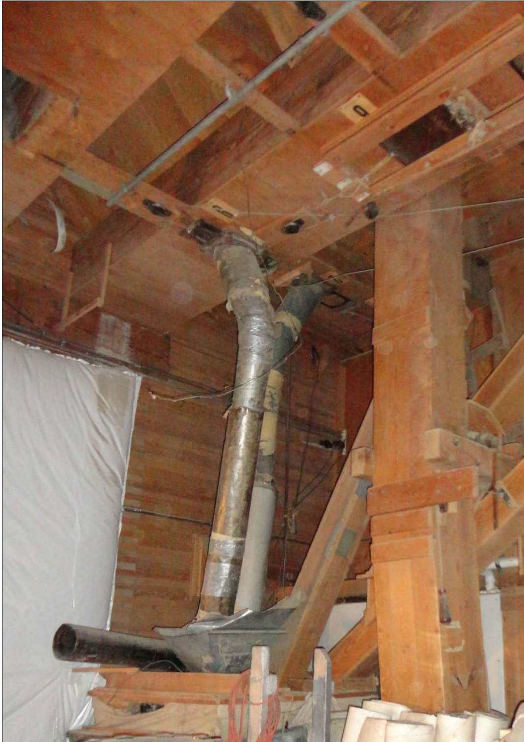
Figure 10: Interior