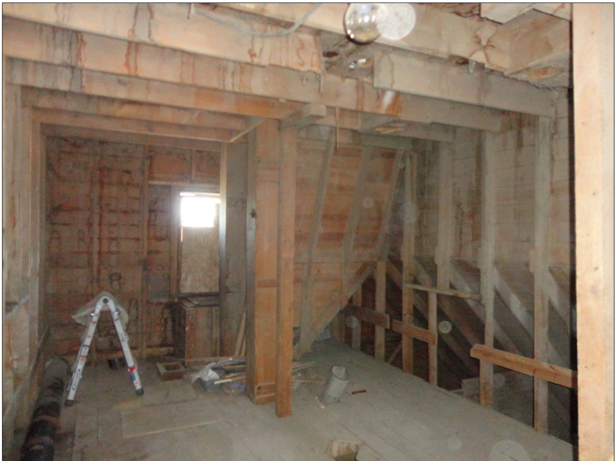
Figure 14: Water damage