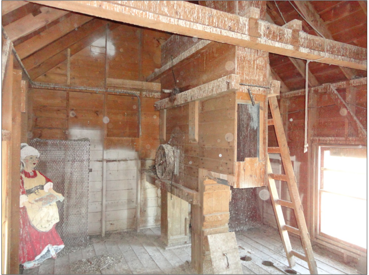
Figure 15: Interior damage from pigeon feces