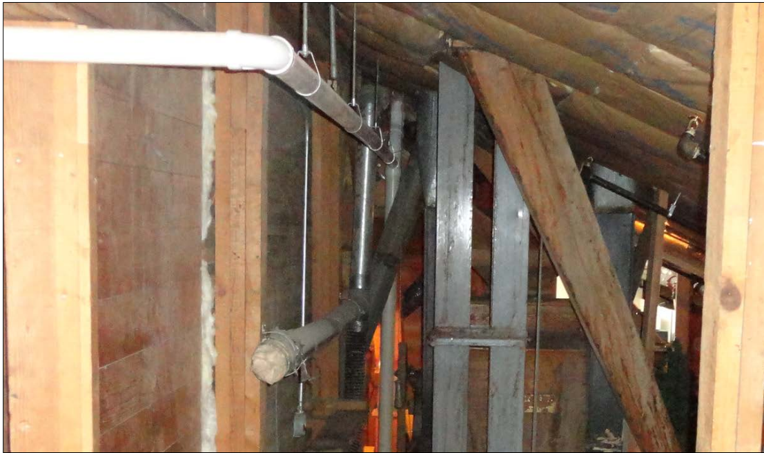
Figure 8: Interior penetration, pipe temporarily sealed