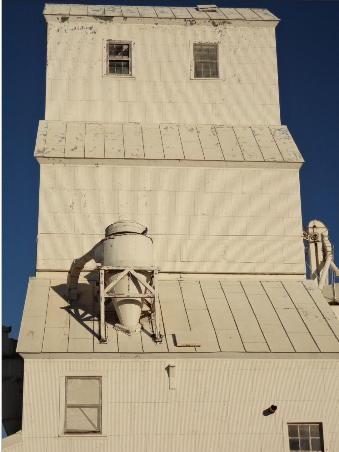
Figure 2: Same view as Figure 1, close up