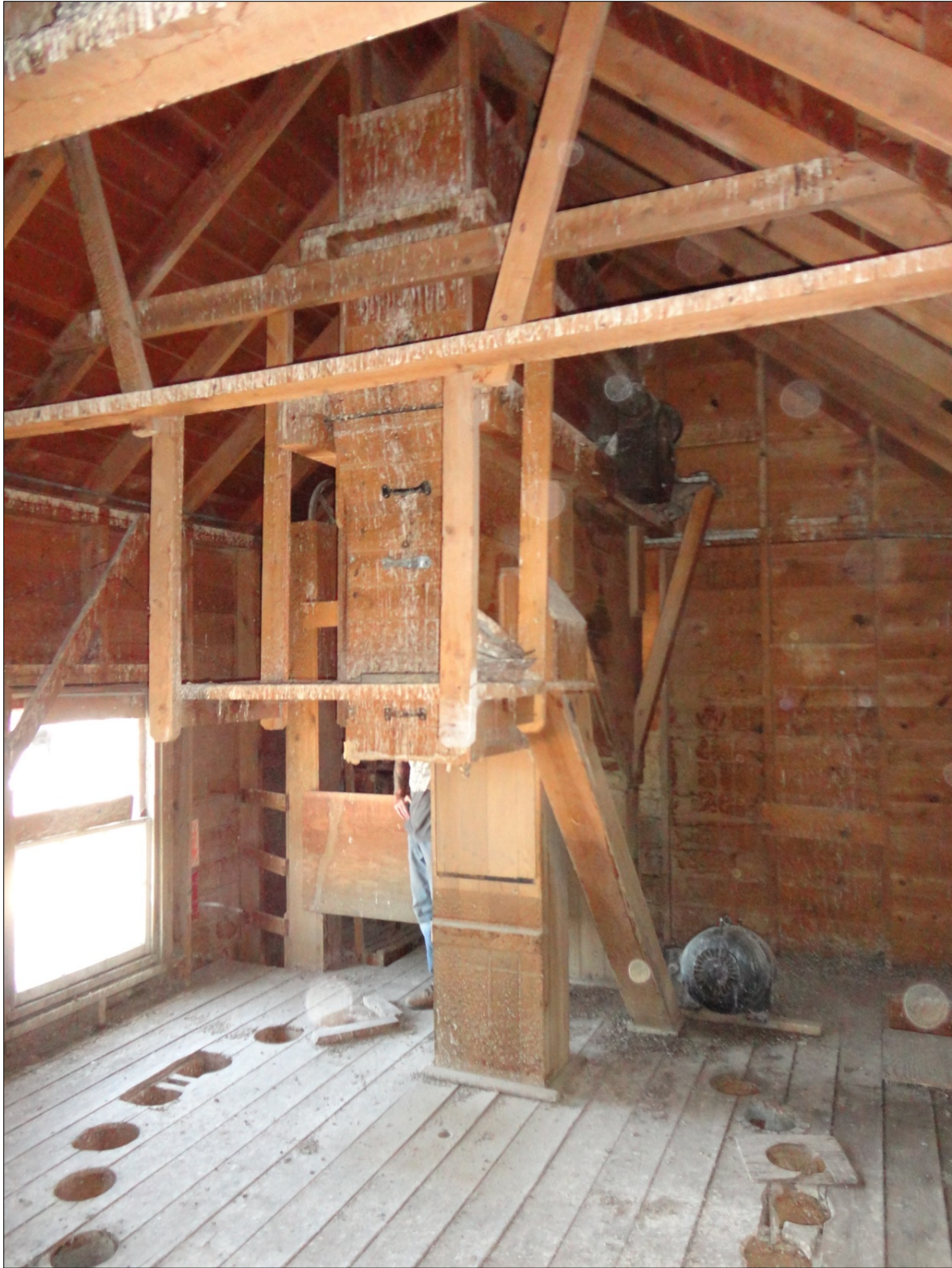
Figure 17: Interior damage from pigeon feces