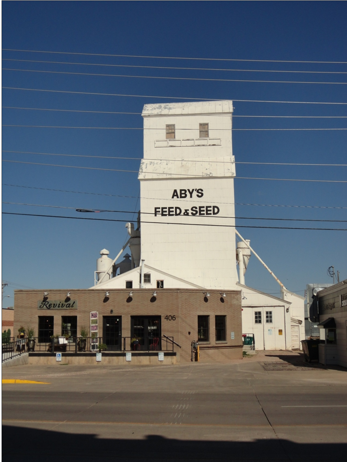
Figure 6: Looking east from 5th Street