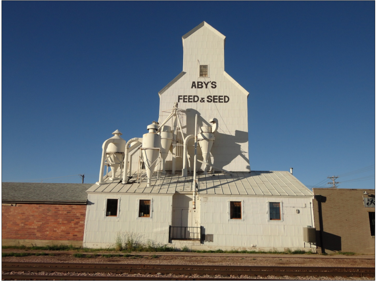
Figure 4: Looking south from railroad tracks on Omaha Street