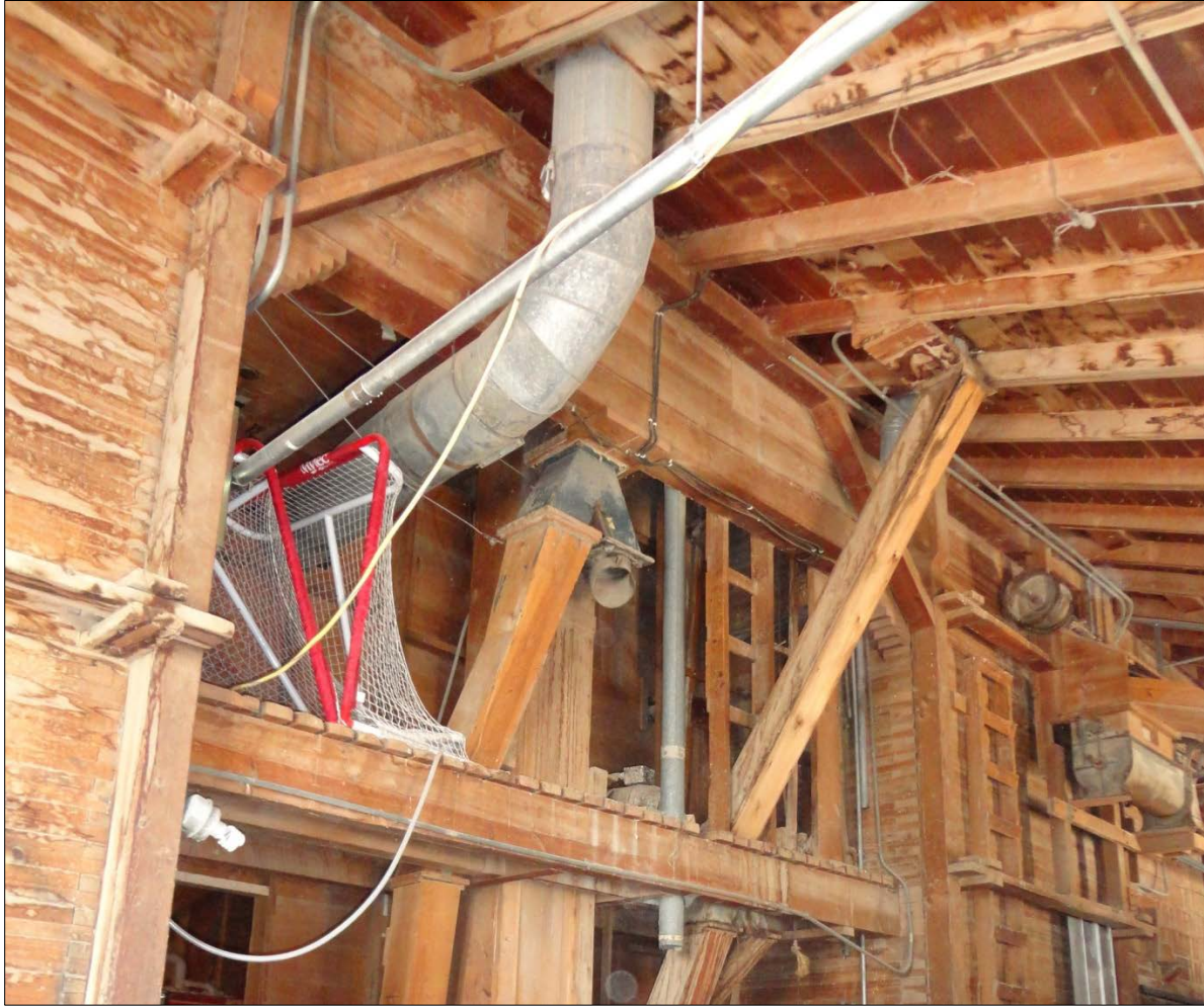
Figure 12: Roof penetration and water damage