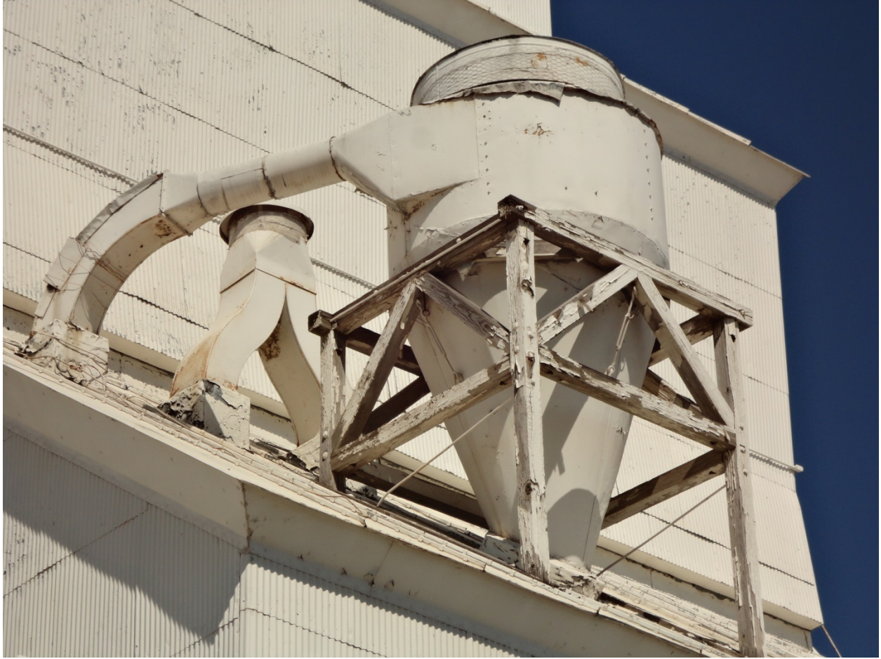
Figure 18: Close-up showing roof top equipment