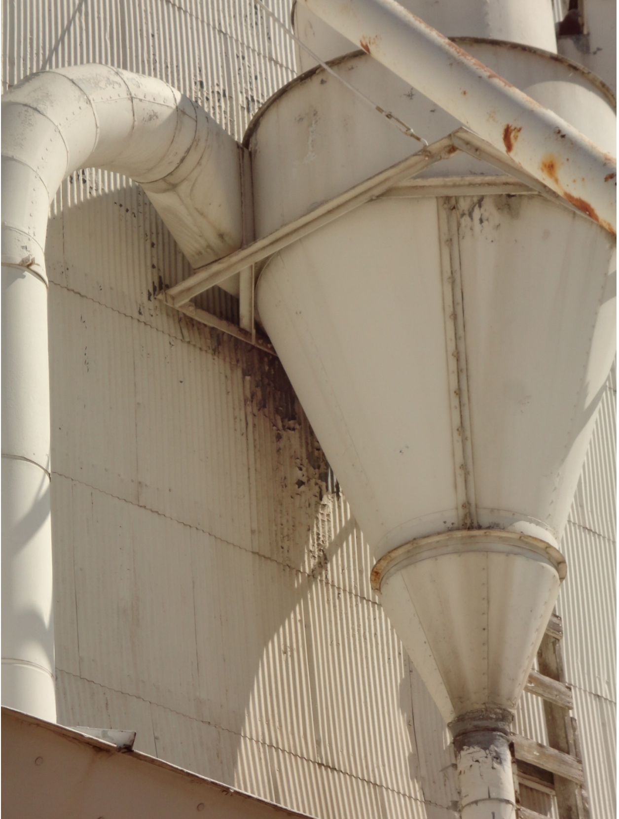
Figure 20: Close-up roof top equipment