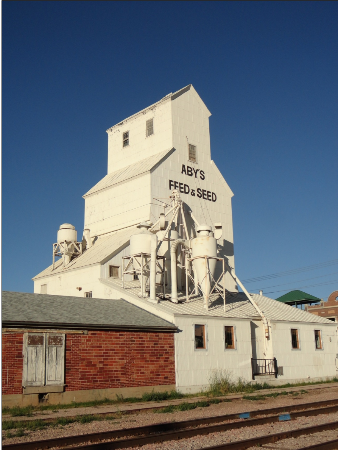
Figure 5: Looking south and west from Omaha Street railroad tracks