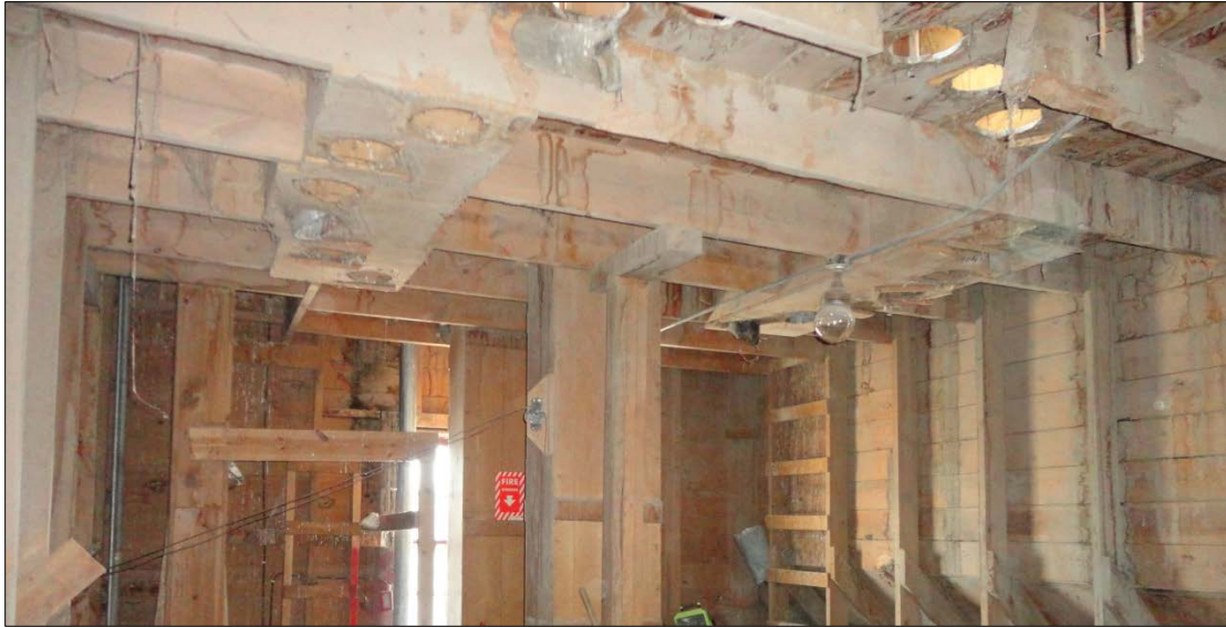
Figure 13: Water damage