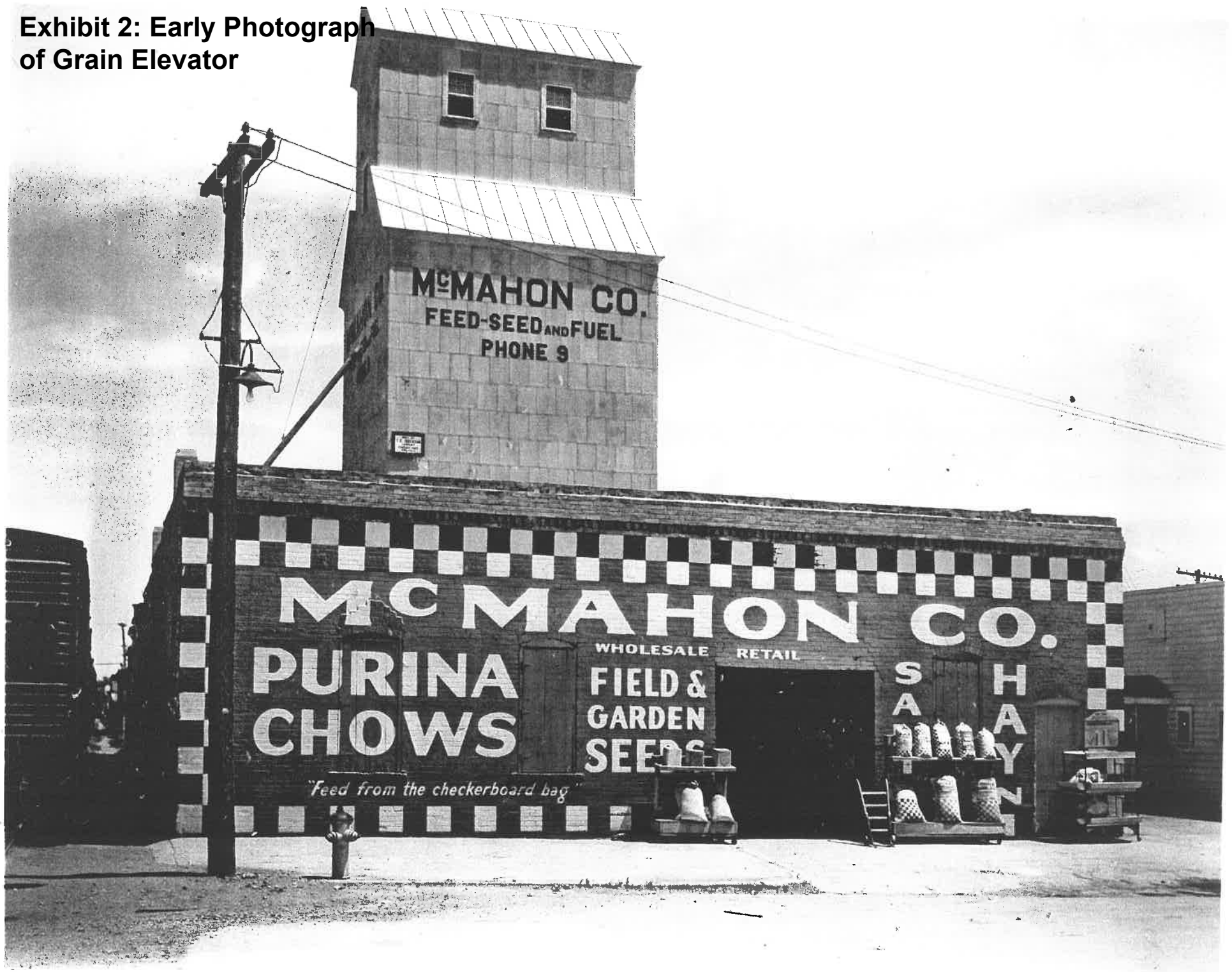
Exhibit 2: Early Photograph of Grain Elevator