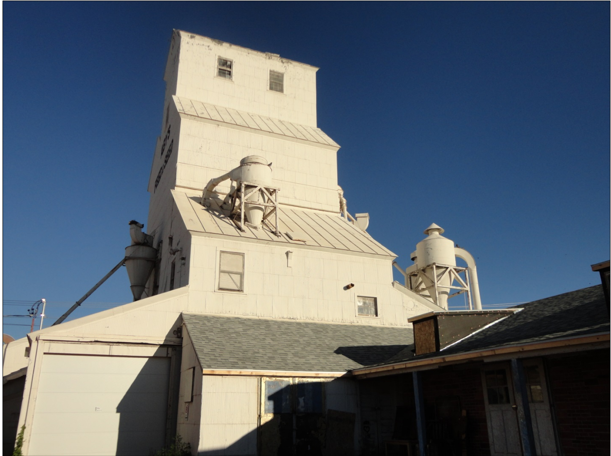
Figure 1: Inside the courtyard looking northwest toward 5th Street and Omaha