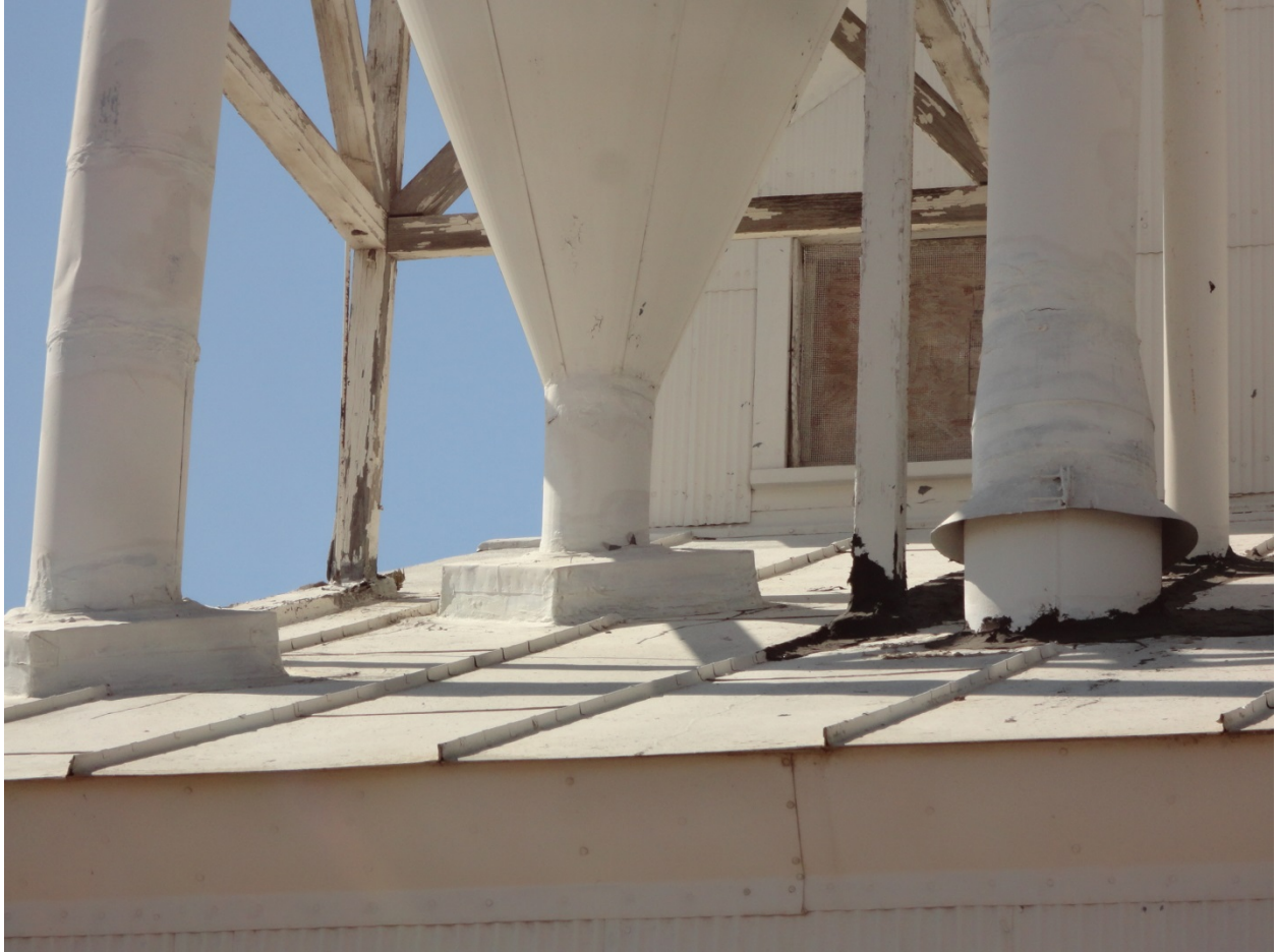
Figure 19: Close-up showing previous sealing efforts on roof top equipment